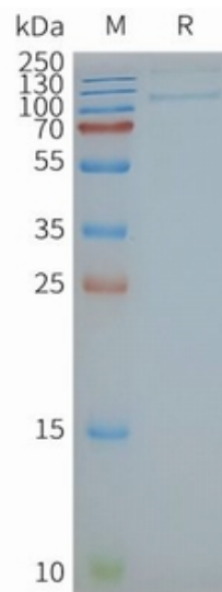
Figure2. Human TLR4-Nanodisc, Flag Tag on SDS-PAGE