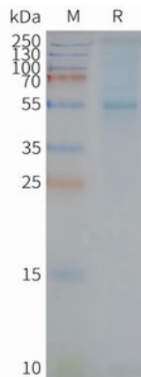
Figure2. Human STEAP2-Nanodisc, Flag Tag on SDS-PAGE