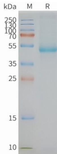
Figure2. Human SLC7A11-Nanodisc, Flag Tag on SDS-PAGE