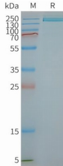
Figure2. Human PLA2R1-Nanodisc, Flag Tag on SDS-PAGE