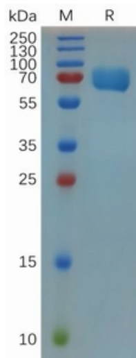
Figure 1. Mouse Trop2 Protein, hFc Tag on SDS-PAGE under reducing condition.