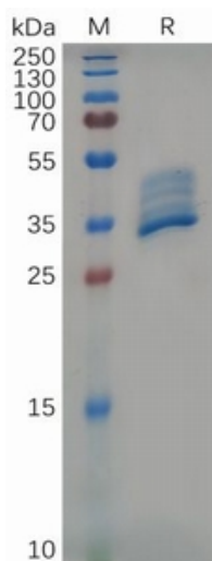
Figure 1. Mouse BCMA Protein, hFc Tag on SDS-PAGE under reducing condition.

储存和运输: Store at -20°C to -80°C for 12 months in lyophilized form. After reconstitution, if not intended for use within a month, aliquot and store at -80°C (Avoid repeated freezing and thawing). Lyophilized proteins are shipped at ambient temperature.