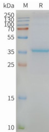
Figure2. Human MLC1-Nanodisc, Flag Tag on SDS-PAGE