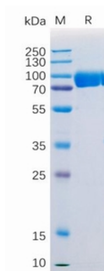
Figure 1. Human SIRP \alpha Protein, mFc Tag on SDS-PAGE under reducing condition.