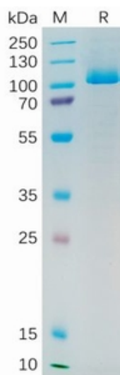
Figure 1. Human PSMA Protein, His Tag on SDS-PAGE under reducing condition.