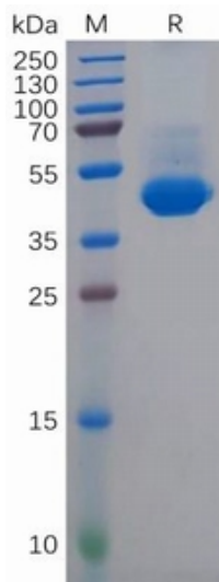
Figure 1. Human NECTIN-4 Protein, His Tag on SDS-PAGE under reducing condition.