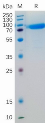
Figure 1. Human IL6R Protein, hFc Tag on SDS-PAGE under reducing condition.

储存和运输: Store at -20°C to -80°C for 12 months in lyophilized form. After reconstitution, if not intended for use within a month, aliquot and store at -80°C (Avoid repeated freezing and thawing). Lyophilized proteins are shipped at ambient temperature.