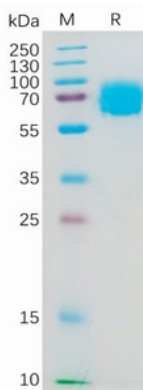
Figure 1. Human IL4RA Protein, hFc Tag on SDS-PAGE under reducing condition.

储存和运输: Store at -20°C to -80°C for 12 months in lyophilized form. After reconstitution, if not intended for use within a month, aliquot and store at -80°C (Avoid repeated freezing and thawing). Lyophilized proteins are shipped at ambient temperature.