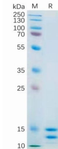
Figure 1. Human IL2 Protein, His Tag on SDS-PAGE under reducing condition.