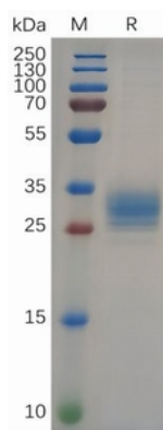
Figure 1. Human FOLR2 Protein, His Tag on SDS-PAGE under reducing condition.

Storage & Shipping: Store at –20°C to –80°C for 12 months in lyophilized form. After reconstitution, if not intended for use within a month, aliquot and store at –80°C (Avoid repeated freezing and thawing). Lyophilized proteins are shipped at ambient temperature.