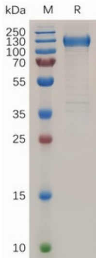
Figure 1. Human FLT1 Protein, His Tag on SDS-PAGE under reducing condition.