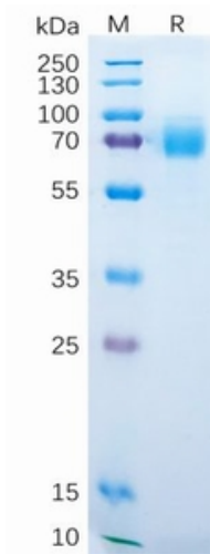
Figure 1. Human DKK1 Protein, hFc Tag on SDS-PAGE under reducing condition.