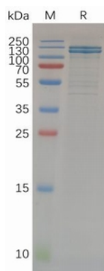
Figure 1. Human CDH1 Protein, hFc Tag on SDS-PAGE under reducing condition.

Storage & Shipping: Store at -20°C to -80°C for 12 months in lyophilized form. After reconstitution, if not intended for use within a month, aliquot and store at -80°C (Avoid repeated freezing and thawing). Lyophilized proteins are shipped at ambient temperature.