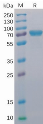
Figure 1. Human CD40 Protein, mFc-His Tag on SDS-PAGE under reducing condition.