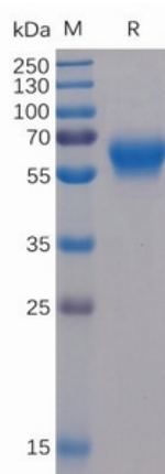
Figure 1. Human BTLA Protein, mFc-His Tag on SDS-PAGE under reducing condition.