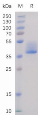
Figure 1. Human BAFF-R Protein, hFc Tag on SDS-PAGE under reducing condition.

储存和运输: Store at -20°C to -80°C for 12 months in lyophilized form. After reconstitution, if not intended for use within a month, aliquot and store at -80°C (Avoid repeated freezing and thawing). Lyophilized proteins are shipped at ambient temperature.