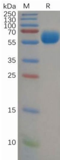
Figure 1. Human B7-H5 Protein, hFc Tag on SDS-PAGE under reducing condition.