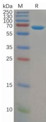
Figure 1. Human ALB Protein, His Tag on SDS-PAGE under reducing condition.

储存和运输: Store at -20°C to -80°C for 12 months in lyophilized form. After reconstitution, if not intended for use within a month, aliquot and store at -80°C (Avoid repeated freezing and thawing). Lyophilized proteins are shipped at ambient temperature.