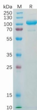
Figure 1. Human AFP Protein, hFc Tag on SDS-PAGE under reducing condition.

Storage & Shipping: Store at -20°C to -80°C for 12 months in lyophilized form. After reconstitution, if not intended for use within a month, aliquot and store at -80°C (Avoid repeated freezing and thawing). Lyophilized proteins are shipped at ambient temperature.