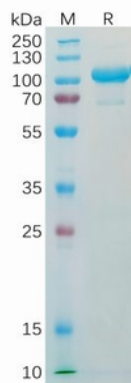
Figure 1. Human AFP Protein, hFc Tag on SDS-PAGE under reducing condition.

储存和运输: Store at -20°C to -80°C for 12 months in lyophilized form. After reconstitution, if not intended for use within a month, aliquot and store at -80°C (Avoid repeated freezing and thawing). Lyophilized proteins are shipped at ambient temperature.