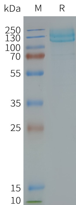
Figure 2. Human GRM7-Nanodisc, Flag Tag on SDS-PAGE