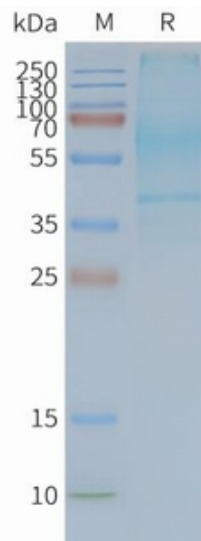
Figure2. Human GPR20-Nanodisc, Flag Tag on SDS-PAGE