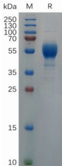
Figure 1. Cynomolgus IL9 Protein, hFc Tag on SDS-PAGE under reducing condition.