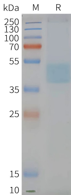
Figure 2. Human CXCR6-Nanodisc, Flag Tag on SDS-PAGE