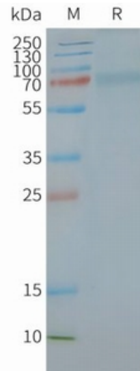
Figure2. Human CGRPR-RAMP1-Nanodisc, Flag Tag on SDS-PAGE