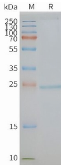
Figure2. Human CD81-Nanodisc, Flag Tag on SDS-PAGE