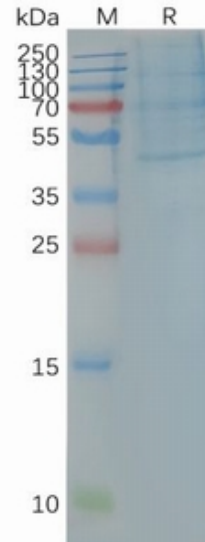
Figure2. Human CCR4-Nanodisc, Flag Tag on SDS-PAGE