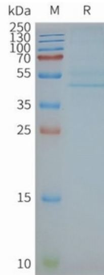
Figure2. Human CCR3-Nanodisc, Flag Tag on SDS-PAGE