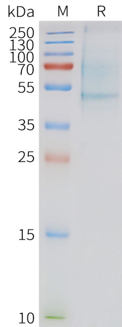
Figure 2. Human APLNR-Nanodisc, Flag Tag on SDS-PAGE