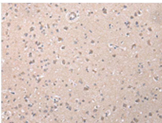
Immunohistochemistry analysis of paraffin embedded Human brain tissue using 218056(ZCCHC9 Antibody) at a dilution of 1/30(Cytoplasm).

Storage & Shipping: Store at -20°C. Avoid repeated freezing and thawing