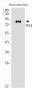
Western blot analysis of MS2 in mouse pancreas lysates using MS2 antibody.