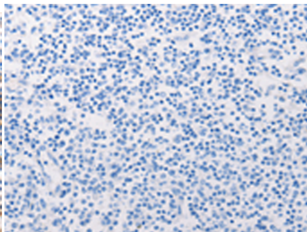
In comparison with the IHC on the left, the same paraffin-embedded Human tonsil tissue is first treated with the synthetic peptide and then with 219813(Anti-GJB6 Antibody) at dilution 1/40.