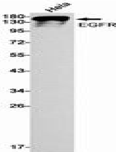
Western blot analysis of EGFR in Hela lysates using EGFR antibody.